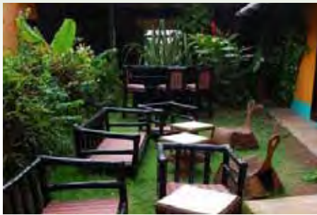
Cabier Courtyard Garden