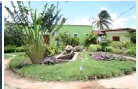
Entrance to Cabier Large Family Ocean Flat