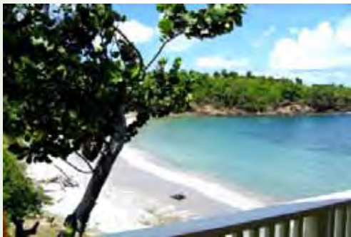
Cabier Beach Bedroom View

Cabier Ocean Lodge and Two Bays are on a promontory surrounded by water on three sides. On one side is a perfect white sand beach with a clear calm sea, on the other a shallow bay, used only by a couple of small fishing boats and a family of pelicans. Ahead is the open sea where you can watch the waves breaking against the reef that protects our beaches and behind you can see the mountains covered with rainforest. There are no other hotels or buildings on the headland or beaches and it is in a completely natural environment, but with all the comforts that you might need.