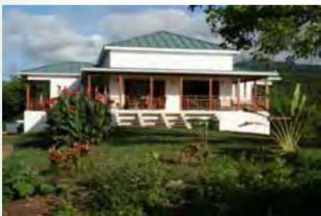
Two Bays Villa and Bayside Studio Two Bays Villa Sitting Room

In addition, above and behind the Lodge on the promontory, is our premium accommodation, the simply elegant Two Bays Villa and two large Studios, with all furniture and fittings finished in sustainable hardwood and large deep shaded verandas.