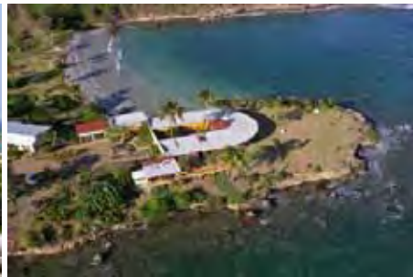
Aerial view of Cabier Beach Star Apartment