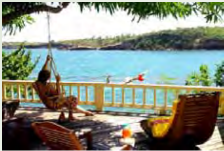
Cabier Terrace Bar