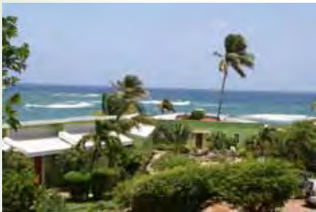
Cabier from Two Bays Superior Guest Room

Cabier Ocean Lodge itself has 11 rooms including a two-bedroom fully equipped family apartment. All rooms are en suite and range from apartments and large superior rooms with cooking facilities to simple but comfortable budget rooms.