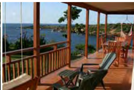
Two Bays Villa Veranda Two Bays Villa Bedroom