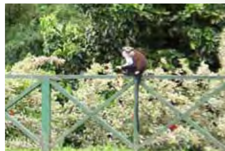
Monkey at Grand Etang

There are also trips to the capital St George's, which is the prettiest harbour in the Caribbean and has good shops and restaurants, to one of several rum distilleries and to the chocolate factory and gardens at Belmont.