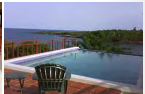
Two Bays Infinity Pool Two Bays Bayside Studio