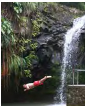
Swimming at Annandale Falls