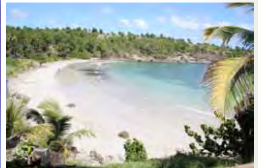
Cabier Beach Bedroom View

We are fully open from early October to late August (outside this period we accept guests for self-catering only – at special reduced rates). High season is from December to the end of April but temperatures in Grenada remain fairly constant at 26 – 30 degrees all year round. Although the summer months are "rainy season" there is lots of sunshine as showers are usually short and often happen at night. August is Carnival time, when Grenadians and Grenada-lovers from all over the world return home for a week long party with stunning parades and lots of music and street food. There are other festivals and regattas throughout the year.