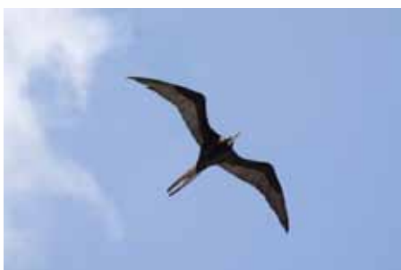
Frigate Bird over Cabier