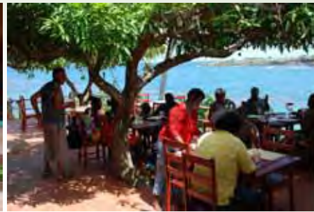
Cabier Terrace Restaurant

There is a terrace bar and restaurant overlooking the sea which is sheltered by mango trees. The restaurant serves breakfast, light lunches and table d'hôte dinner. An à la carte menu for lunch or dinner is also available on request.