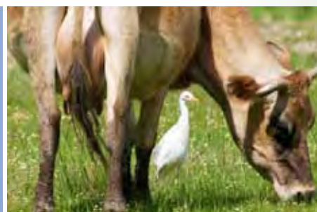
Egret and a Cow at Cabier