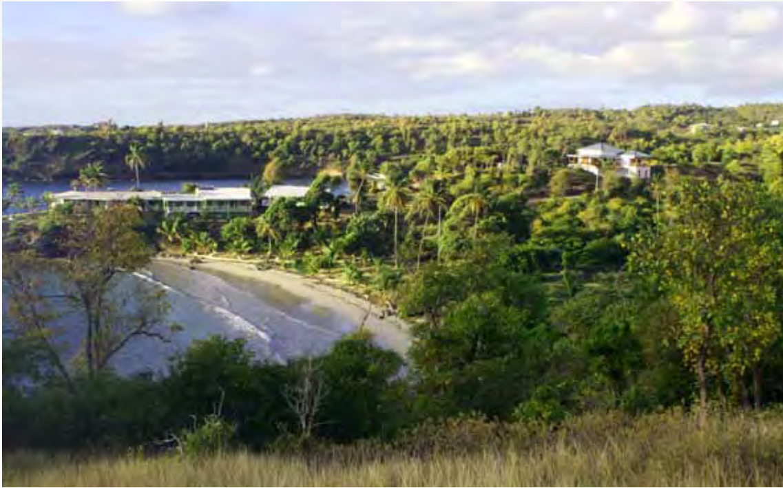
Cabier Beach, Cabier Ocean Lodge and Two Bays Villa & Studios

Cabier Ocean Lodge has been described as 'Grenada's hidden treasure' but you do not need to have a pot of gold to stay there. Cabier is near the village of Crochu on the east coast of Grenada, about 45 minutes from St George's and the airport.